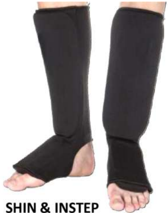
SHIN & INSTEP